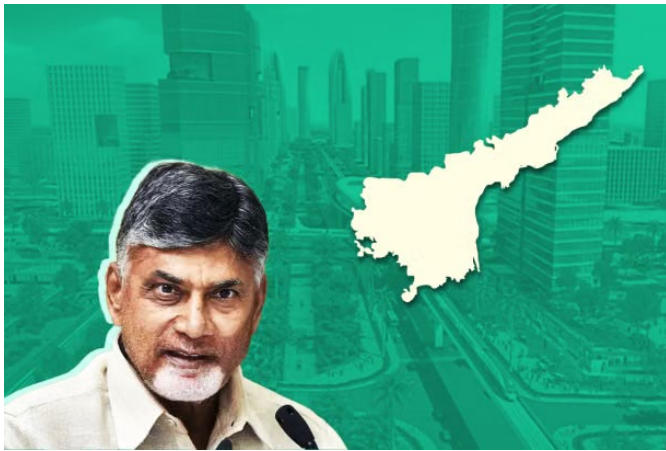
Andhra Pradesh CM Chandrababu Naidu (Representative Image)

The Andhra Pradesh Metro Rail Corporation (APMRC) has announced that joint ventures (JVs) will be permitted to participate in the bidding process for the upcoming metro rail projects in Visakhapatnam and Vijayawada.