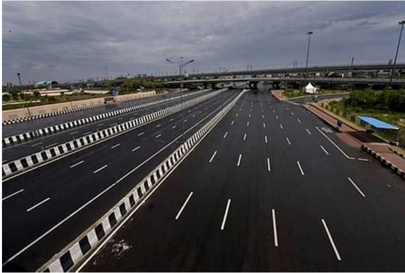
A national highway. (Representational Image).

The Ministry of Road Transport and Highways has constructed a total length of over 3,600 km of high-speed corridors during the last five years, the Parliament was informed on Wednesday (2 April).