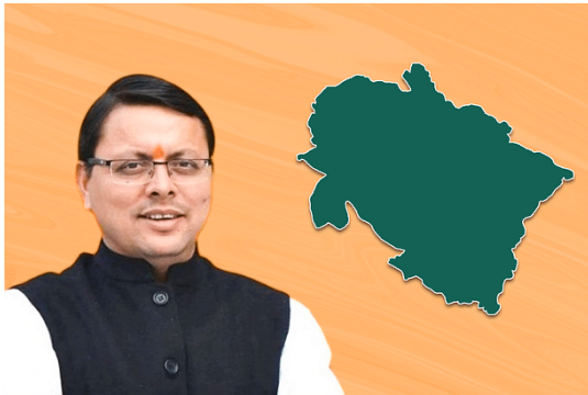
Uttarakhand Chief Minister Pushkar Singh Dhama.

The Central Government has sanctioned Rs 164.67 crore under "Scheme for Special Assistance to States for Capital Expenditure" for various development works in Uttarakhand's Dehradun and Nainital, ANI reported.