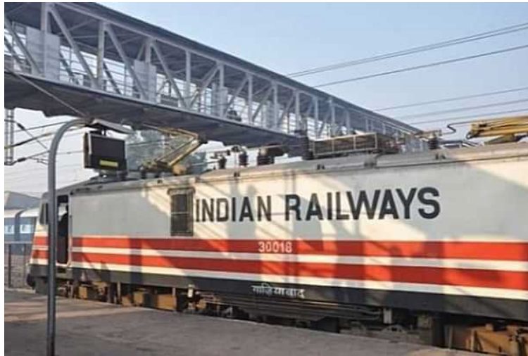
Indian Railways (Representative Image)

A total of 41 railway projects covering 5,877 km and costing Rs 81,580 crore are underway in Maharashtra, the Ministry of Railways has informed the Lok Sabha.