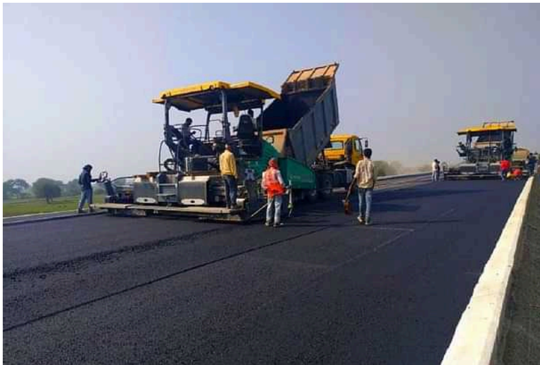
Highway construction in Uttar Pradesh - a representative image.

NHAI Exceeds Highway Construction Target In FY25, Builds 5,614 Km Against 5,150 Km Goal Swarajya, April 03, 2025